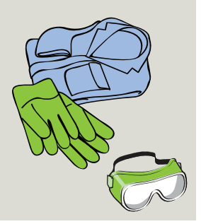
Use appropriate PPE as indicated in the Safety Data Sheet.

Automatic Machines (Industrial Automatic Dish and Glasswashing Machines), Bain Maries, Water Boilers and Coffee Machines