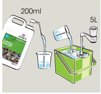
Dilute 200ml solution per 5 litres of water.